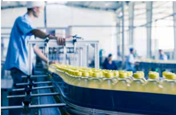
Fig.: Innovative barrier coatings for PET bottles

Surface4Food is a multidisciplinary network that pursues the common goal of refining surfaces in the food manufacturing and processing industry to provide efficient and effective cleanability and preventive properties against recurring germ growth. One possible solution is the use of photocatalytic, self-cleaning, anti-adhesive or antimicrobial coatings. Objects that can be treated with these coatings include production plants, conveyor belts, storage and cooling facilities, work surfaces or cutting equipment.