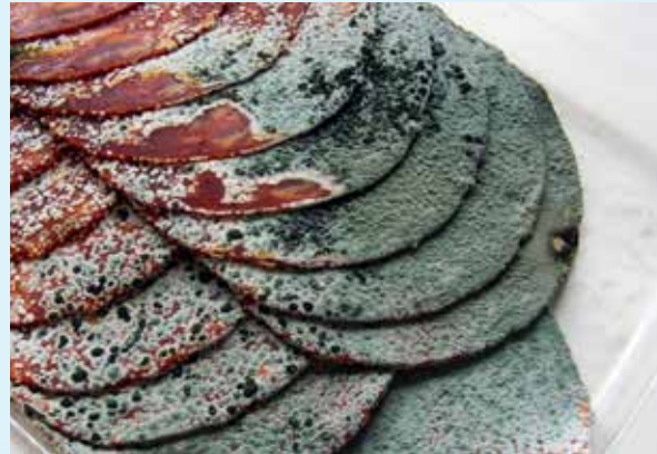
Fig.: Mouldy food due to contaminated surfaces

The network brings together companies and research institutions from the overall food industry supply chain. Apart from scientific knowhow, the network partners contribute their entrepreneurial skills in areas such as plant construction, cleaning technologies, food processing, packaging and food hygiene.