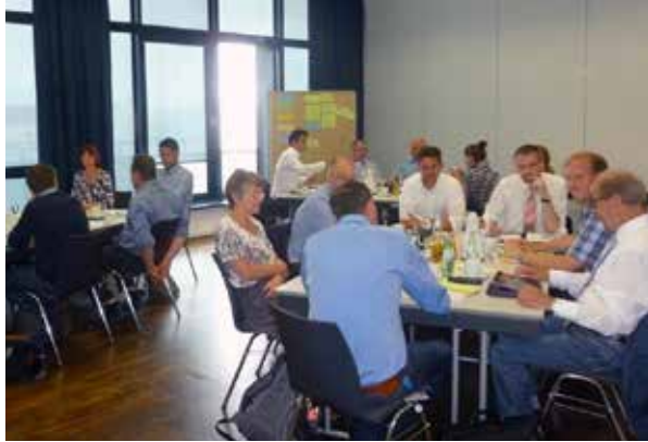
Fig.: Network meeting in the INP Greifswald

As an active partner in the Surface4Food network of excellence you will profit from a variety of offers and benefits: