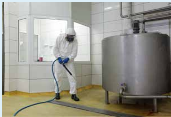
Fig.: The current cleaning methods are very extensive and complex

Additional to the daily cleaning and disinfection of the whole production plant and facilities, typical preventive actions include several pre-processing washing steps and special preservation techniques. These techniques require an extensive input of time and resources, and are thus very cost-intensive.